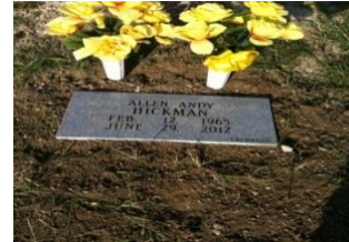
small headstone - $150.00

a crescent can be added for an additional $60.00 (a ceramic picture)